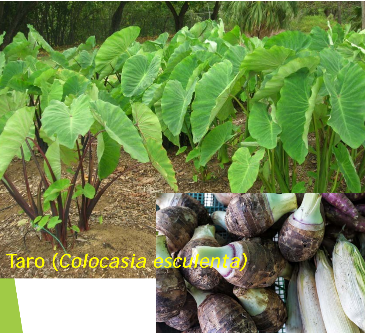
Taro ( Colocasia esculenta )