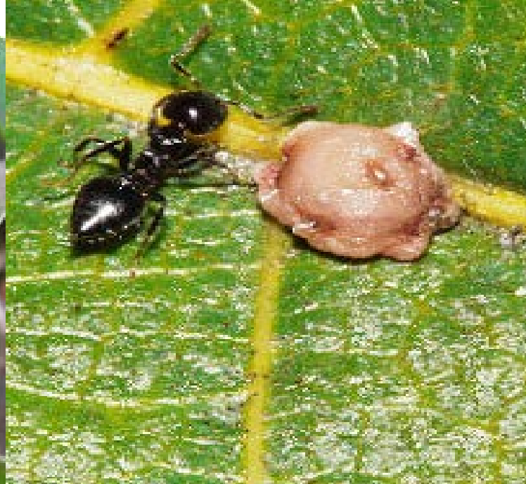
Pink Wax Scale ( Ceroplastes rubens )