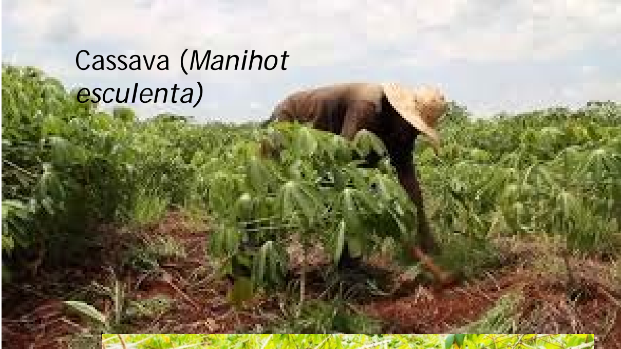
Cassava ( Manihot esculenta )