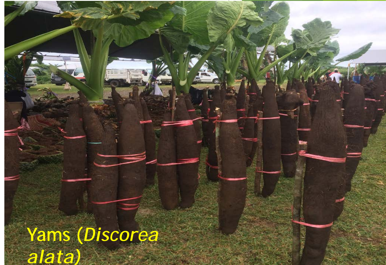
Yams ( Discorea alata )