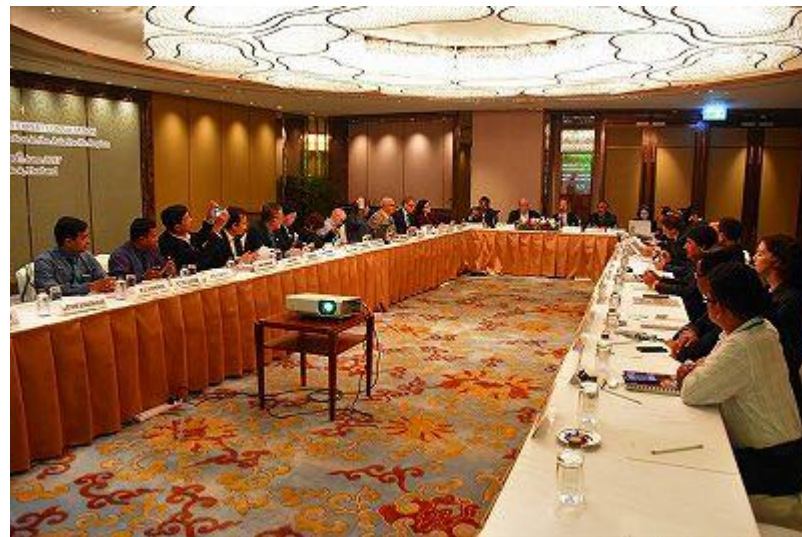
The 3rd APSA Phytosanitary Expert Consultation (29-30 June 2017 in Bangkok, Thailand)