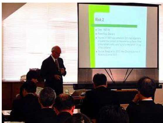
IPPC seminar : Plant health standards and trade facilitation