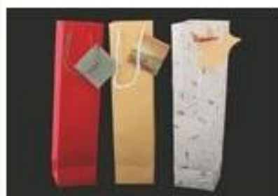
Plantable Wine Gift Bag With 3.5" Gusset - Seed Paper (15"X3.5") $4.85 - $5.50