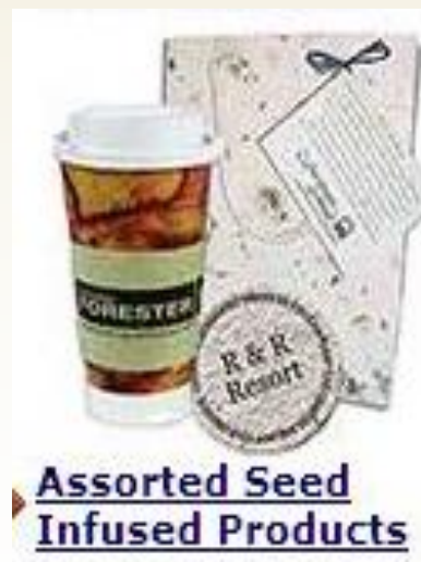
novelty item with seed