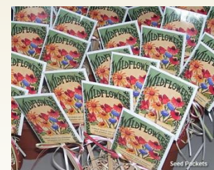
wildflower seed packets