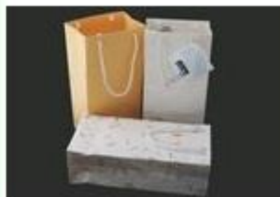
Large Plantable Gift Bag With 3.5" Gusset - Seed Paper (5.75"X11.5") $4.85 - $5.50