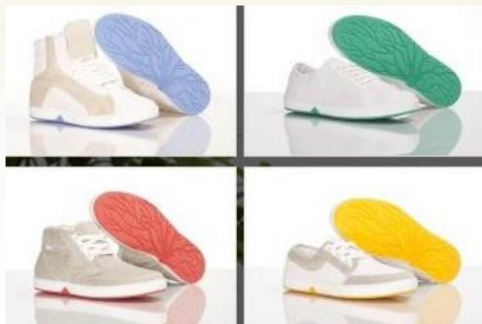
Shoes infused with seeds