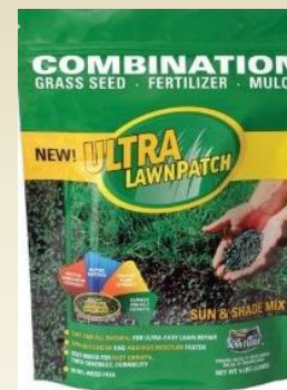
grass seed- fertilizer - mulch combination