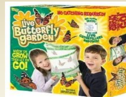
Butterflies as pets