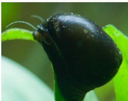
Nerita sp. snail advertised as biocontrol agent of algae in aquaria