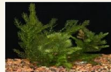
Aquatic plants Eichhornia crassipes & Ceretophyllum demersum