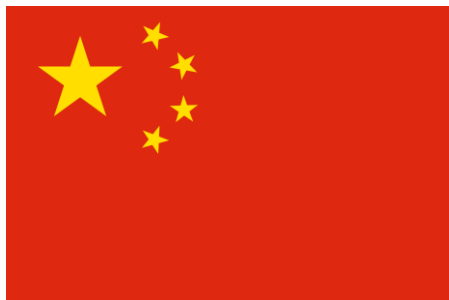
China South-South cooperation