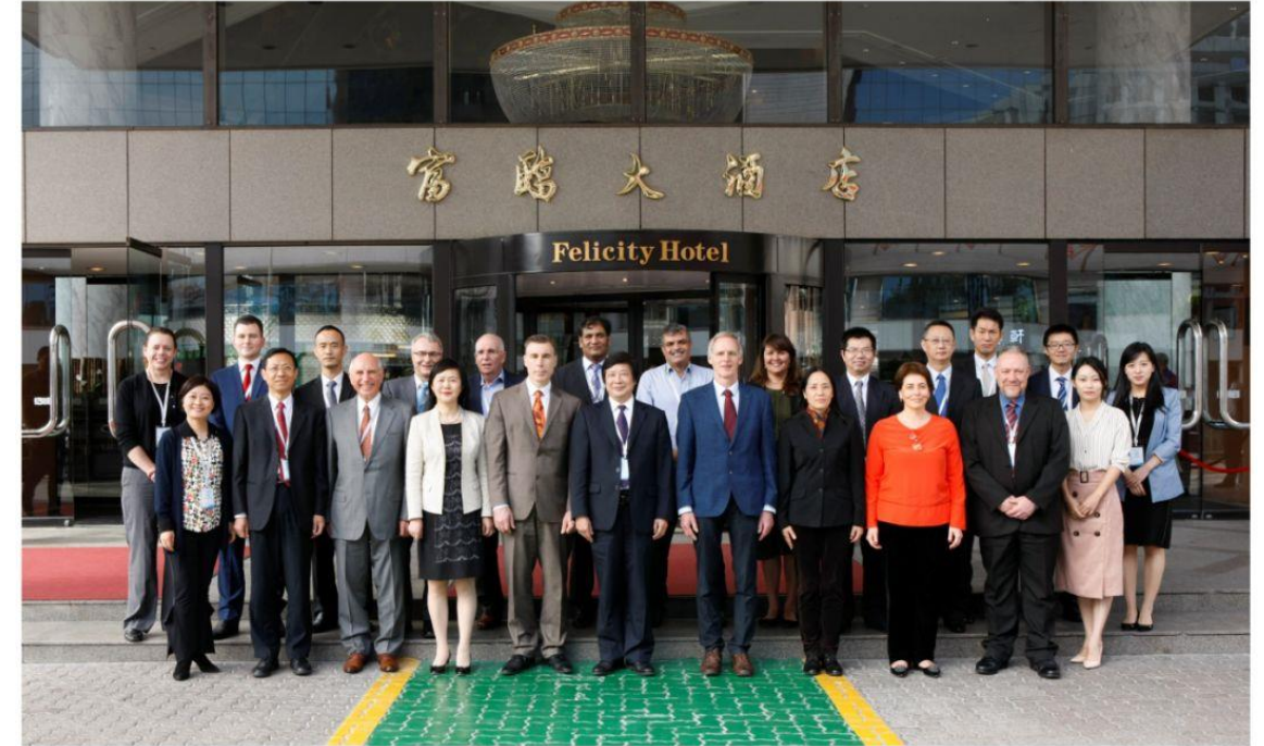
The 2 nd Meeting of the Sea Containers Task Force