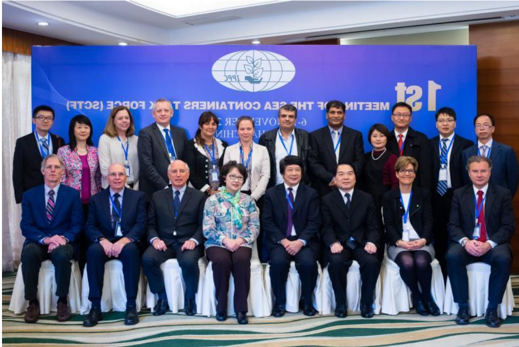
The 1 st Meeting of the Sea Containers Task Force