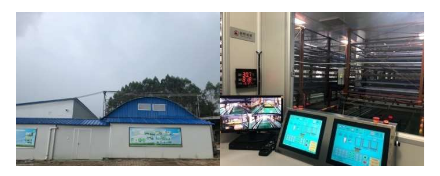
米蛾自动化生产线投入运行 Launch of automatic production line of Corcyra cephalonica