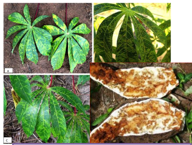
Cassava brown streak disease