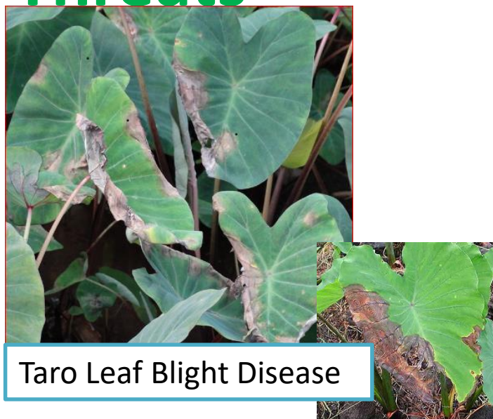
Taro Leaf Blight Disease