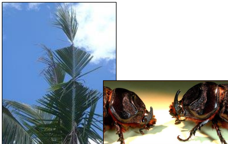
Coconut Rhinoceros Beetle