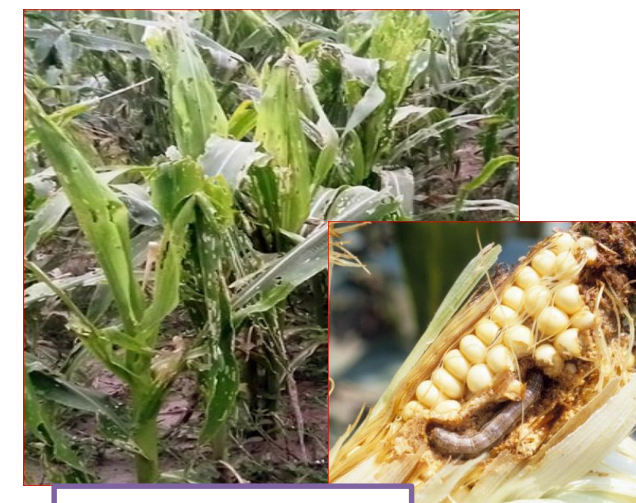
Fall Army Worm