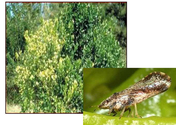
Citrus Greening Disease