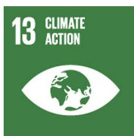
Goal 13. Take urgent action to combat climate change and its impacts.

[91] The work of the IPPC for this strategic objective strongly supports the UN 2030 sustainable development goals 13 and 15.