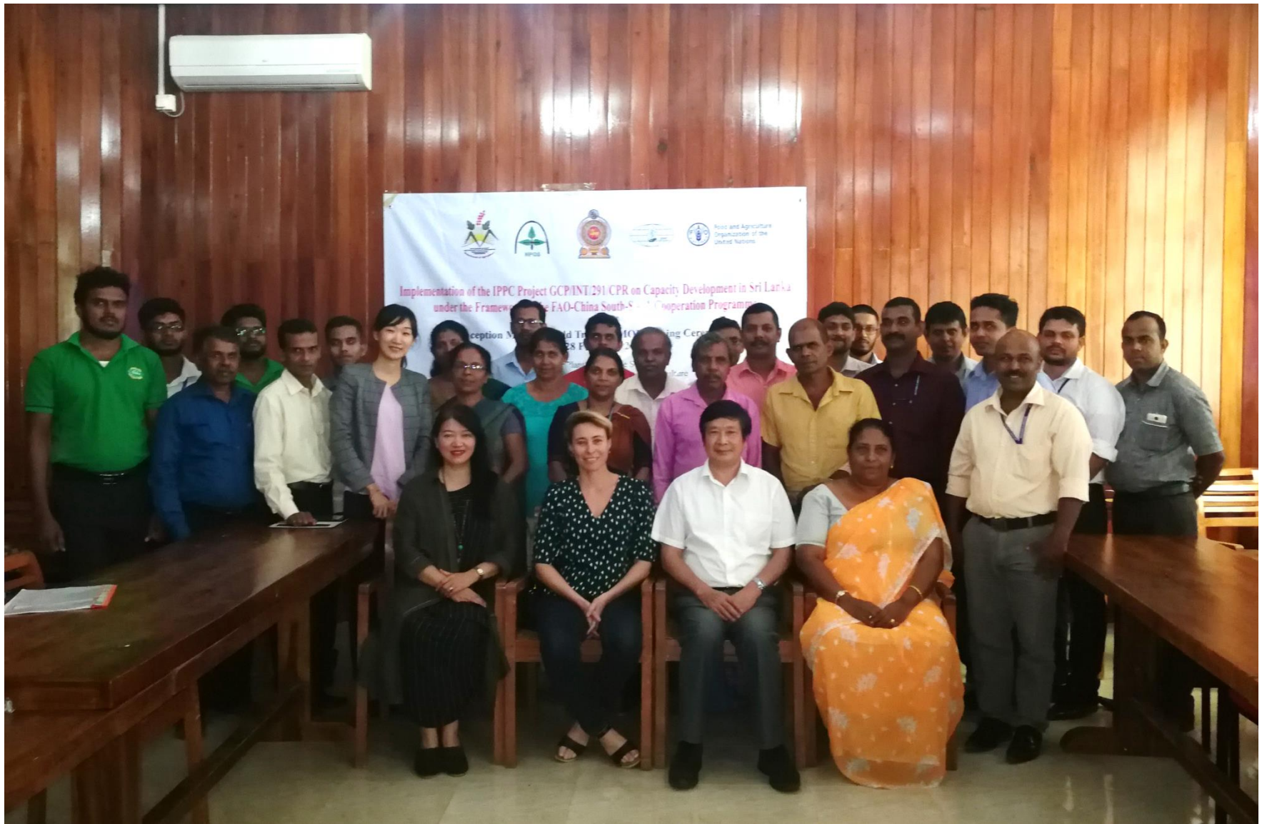
Meeting with farmers, company staff and local technical extension staff of Sri Lanka, Feb. 2019