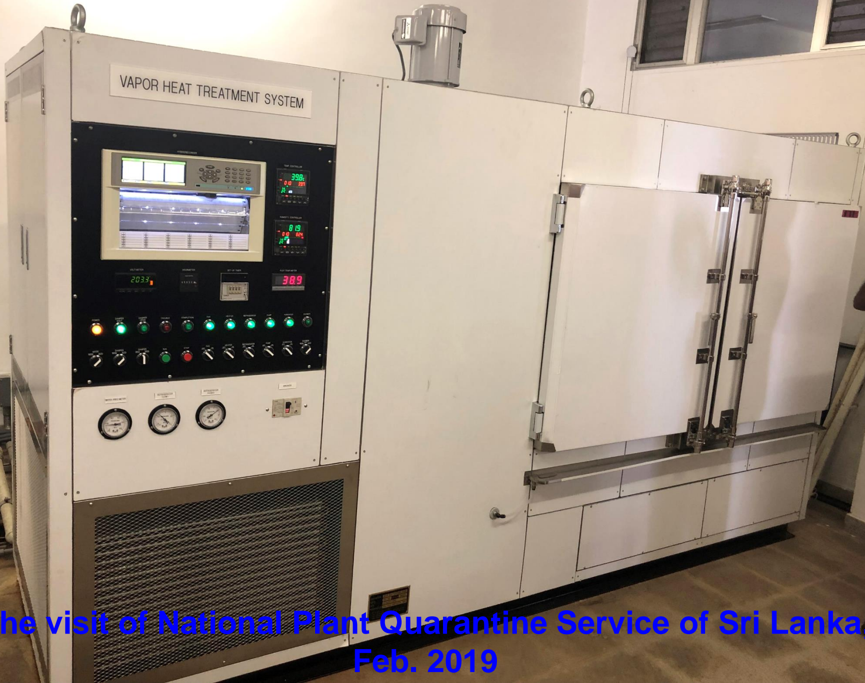
The visit of National Plant Quarantine Service of Sri Lanka, Feb. 2019