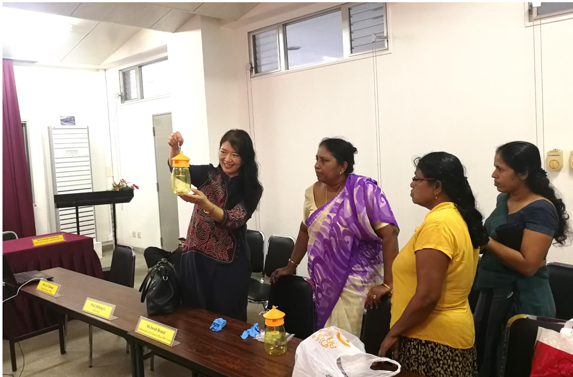
The primary training of quarantine staff of Sri Lanka, Feb. 2019