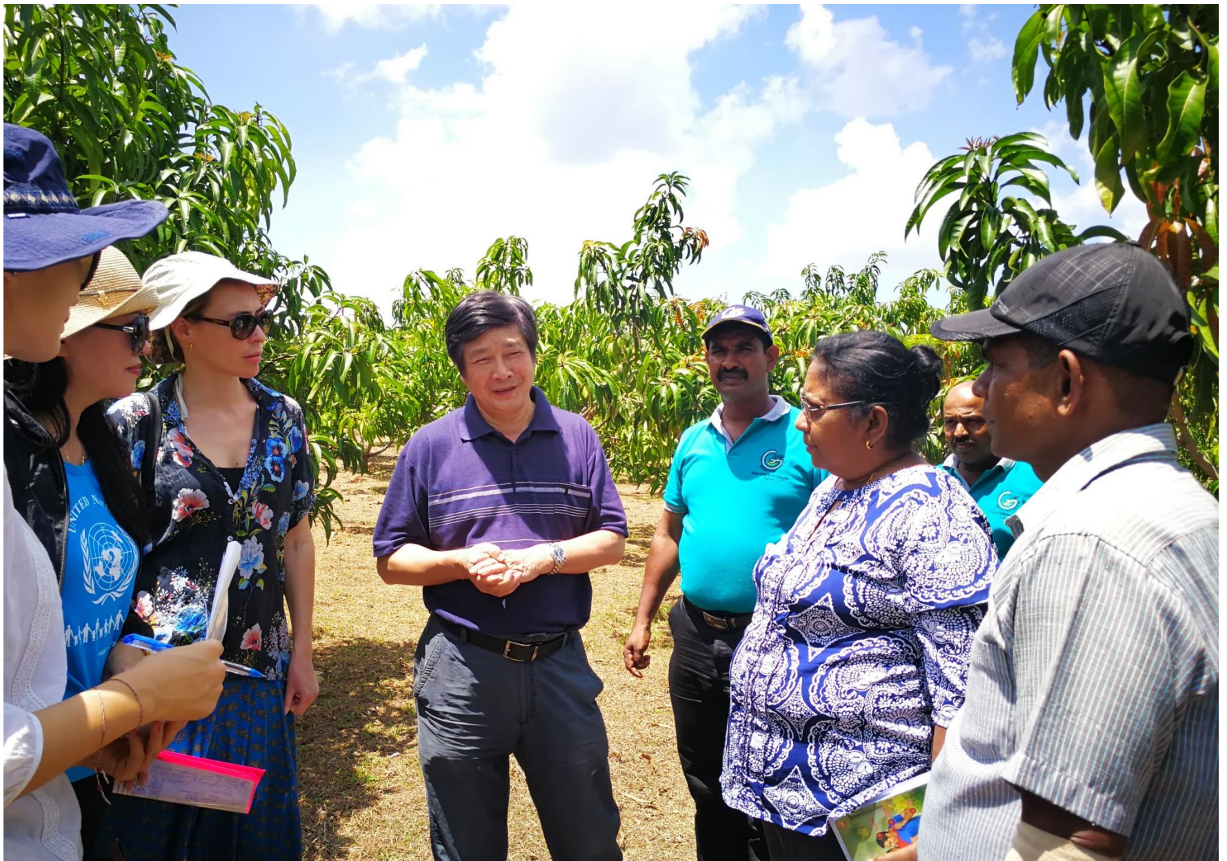
Meeting with farmers and local technical extension staff of Sri Lanka, Feb. 2019