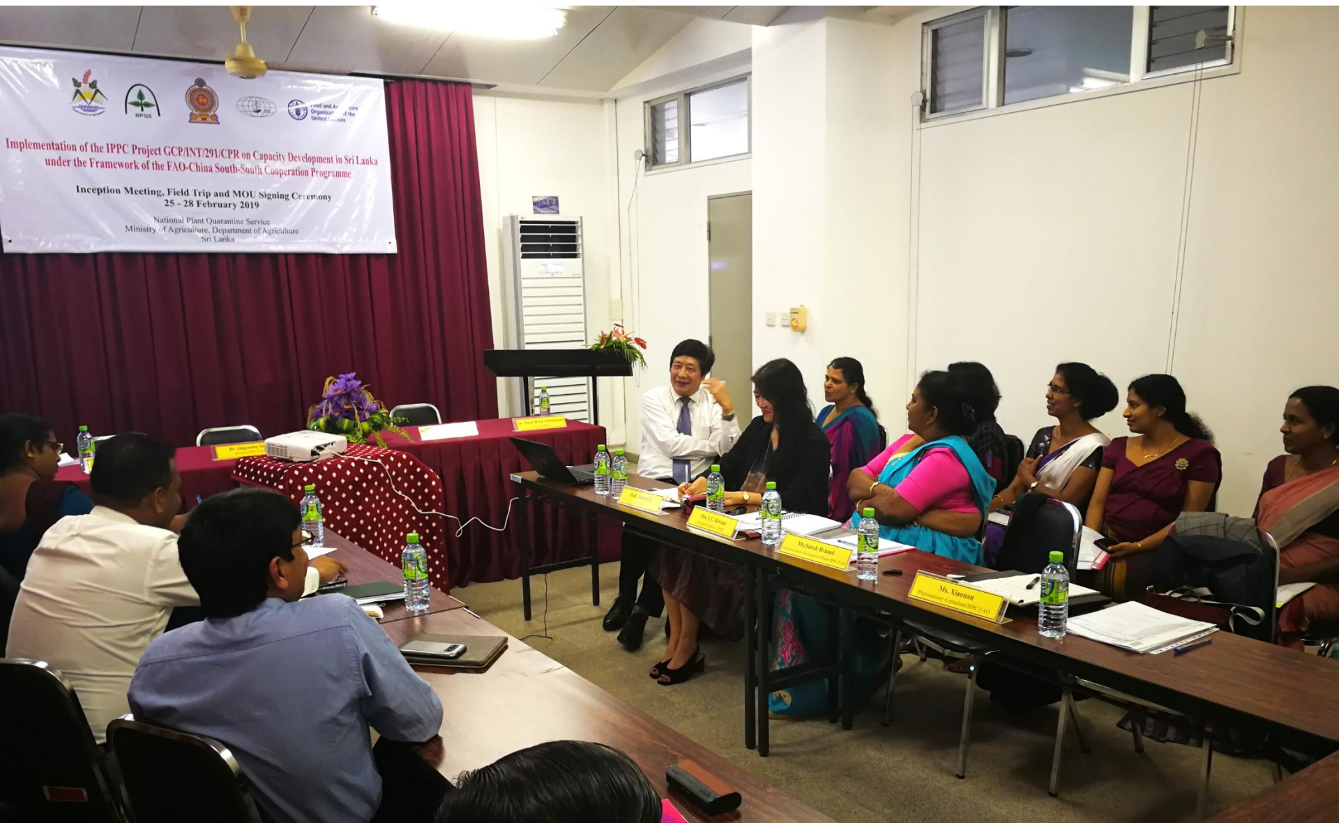
Meeting with main agricultural leaders, quarantine officers and scientists of Sri Lanka, Feb. 2019