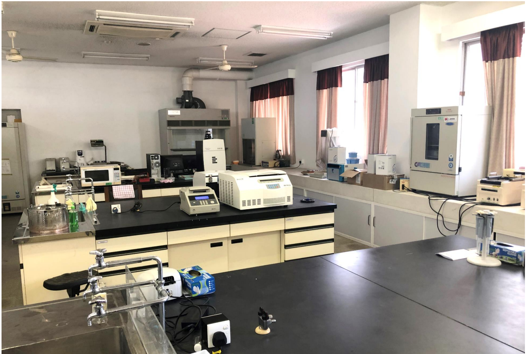
The visit of National Plant Quarantine Service of Sri Lanka, Feb. 2019