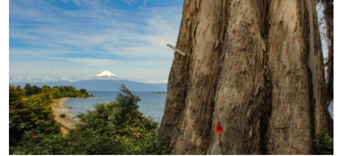
RBP - Argentina, Chile, Colombia, Papua New Guinea