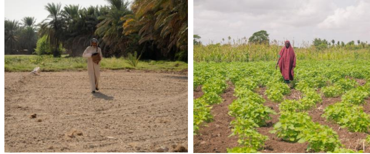
Fragile country context (Somalia, Iraq)