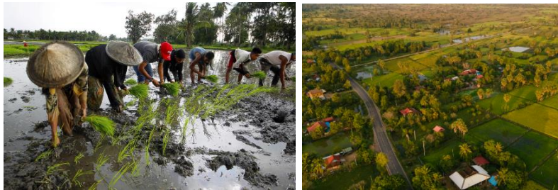
Climate Resilient Agriculture- Philippines, Cambodia, Benin