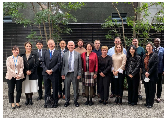
First face to face meeting of TPCS in Japan, 2023.

2018 > 2019 > 2020 > 2021 > 2022 > 2023 > 2024 > 2025