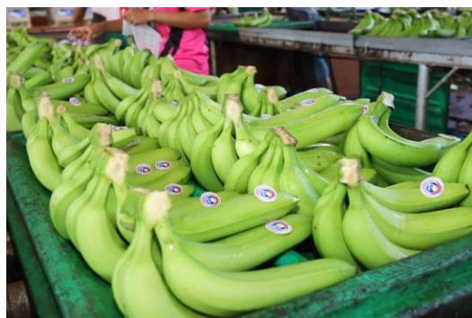
Figure 3. Clusters (parts of hands) of Musa spp