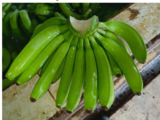
Figure 2. Hand of Musa spp.