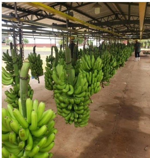
Figure 1. Bunches of Musa spp.