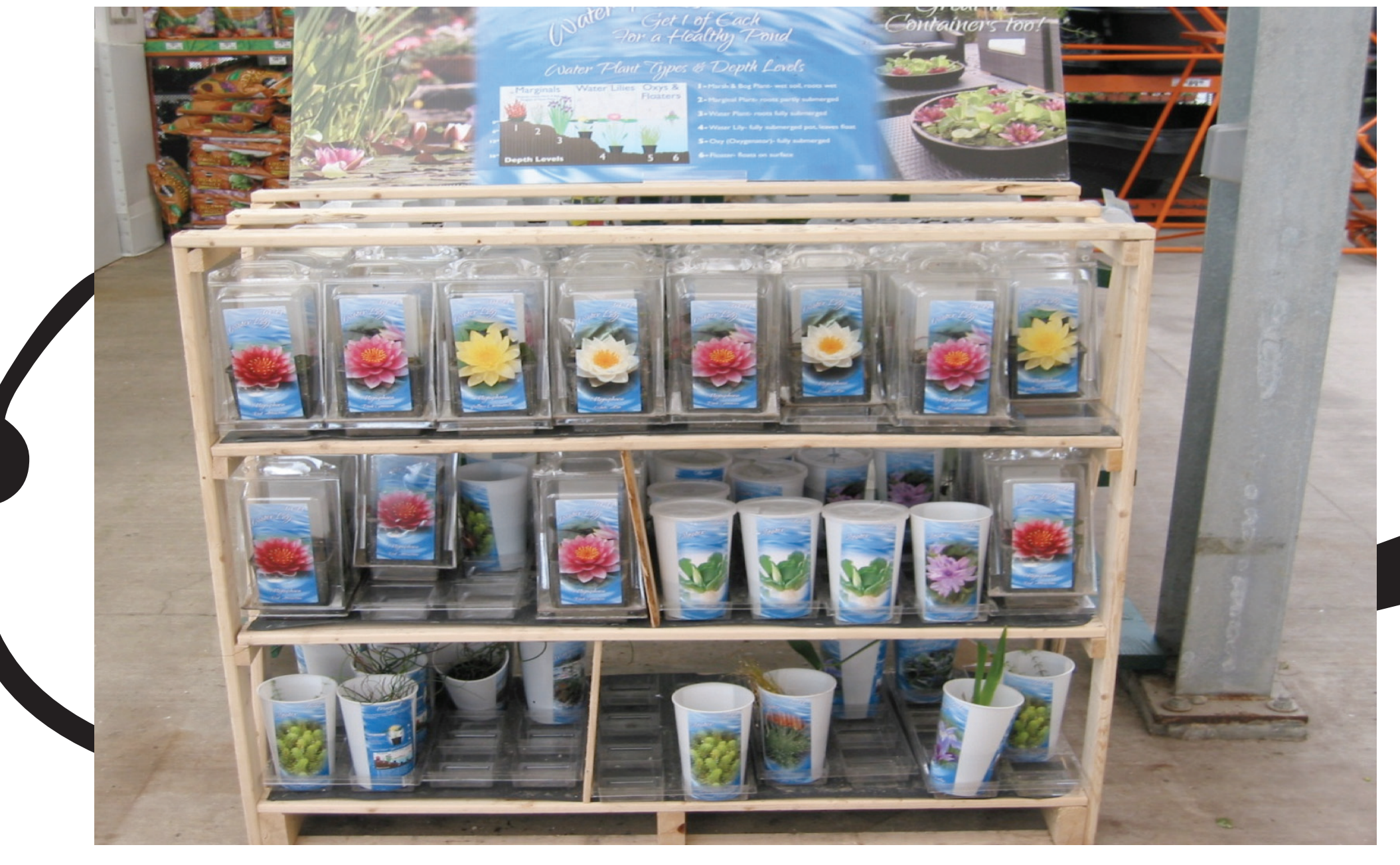
Some plants and plant products for sale through the internet.

A number of websites offer plants, plant products and other articles for sale and distribution that easily bypass traditional screening by National Plant Protection Organizations (NPPOs), including plants of uncertain identity and unknown ecological attributes as well as other organisms for alleged beneficial purposes. The behavior of these organisms when introduced into new environments is not known.