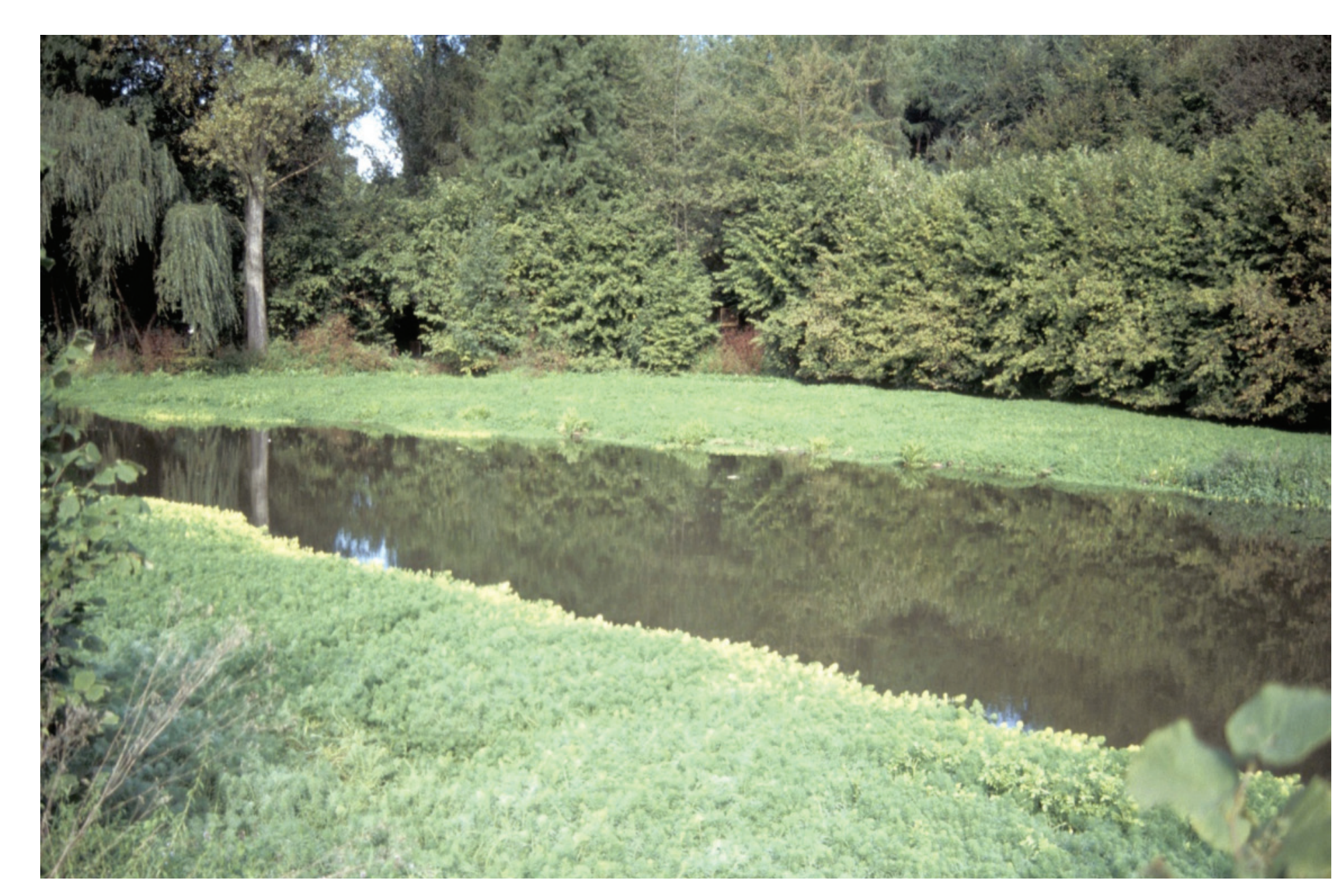
Parrotfeather taking over a river in Germany.

Aquatic plants as plants to be protected and as pests of other plants, i.e. the threats to and from aquatic plants. With respect to 'invasive aquatic plants': Consideration given to expansion of IPPC's mandate to cover invasive alien species that impact biodiversity in aquatic environments. Use of aquatic plants in the ornamental trade is likely to increase as the level of economic development in the world increases.