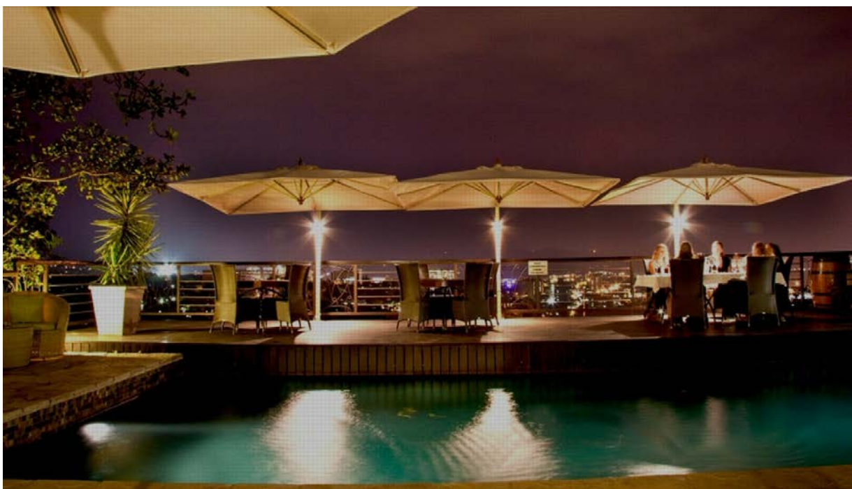
Poolside view over Nelspruit at Orange restaurant near Francolin Lodge & Loerie's Call