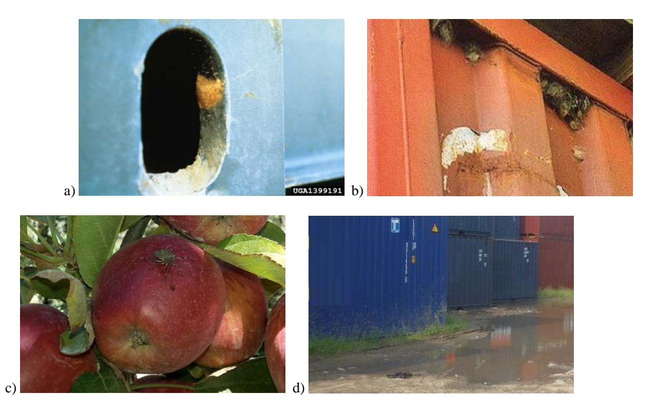
Fig. 2. Examples of contamination and species that are frequently encountered as 'hitchhikers' with sea containers: a) Asian gypsy moth ( Lymantria dispar ) egg mass in a corner fitting of a sea container (photo: Manfred Mielke, USDA Forest Service); b) giant African snails ( Achatina fulica ) on the external surface of a container (photo: New Zealand Ministry for Primary Industries); c) brown marmorated stink bug ( Halyomorpha halys ), here seen piercing and sucking on an apple (photo: Eckehard Brockerhoff, Scion); d) container storage site with bare soil which facilitates contamination of sea containers with soil and potential pests (such as nematodes and soil-borne pathogens (photo: New Zealand Ministry for Primary Industries).