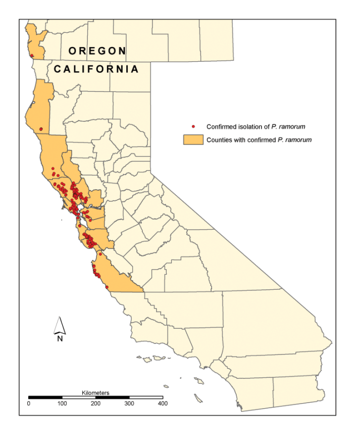
Fig. 4. Distribution of confirmed cases of Phytophthora ramorum in forests of California and Oregon in January 2005.

diences worldwide. In 2000 and 2001, dead trees were common and extremely visible, similar to a wildfire spreading throughout the landscape. The infested area also coincided with one of the most populated and visited areas in North America, the San Francisco Bay Area (Fig. 4). Contrast this with a pathogen such as Phytophthora lateralis, whose geographic range remains confined to a less densely populated and relatively little visited area of the country. The international dimension of the problem, as exemplified by the potential connection between the West Coast of the USA and Europe, and the "interdisciplinary" element of the disease, connecting a disease in the wild and the ornamental plant business, further added to the lure of the subject. Last, but not least, the discovery of the pathogen started a cascade of discoveries. In light of the urgency to stop the disease from further spreading, discoveries pertinent to the