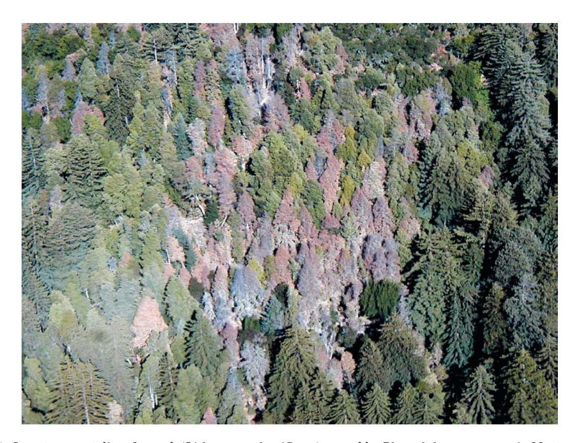
Fig 1. Overstory mortality of tanoak ( Lithocarpus densiflorus ) caused by Phytophthora ramorum in Monterey Co. (Big Sur), CA.

When local San Francisco Bay Area arborists and farm advisors noticed the disease had started to affect coast live oak ( Quercus agrifolia Née) (Svihra, 1999b), a greater concern arose among professionals and the public. In order to understand