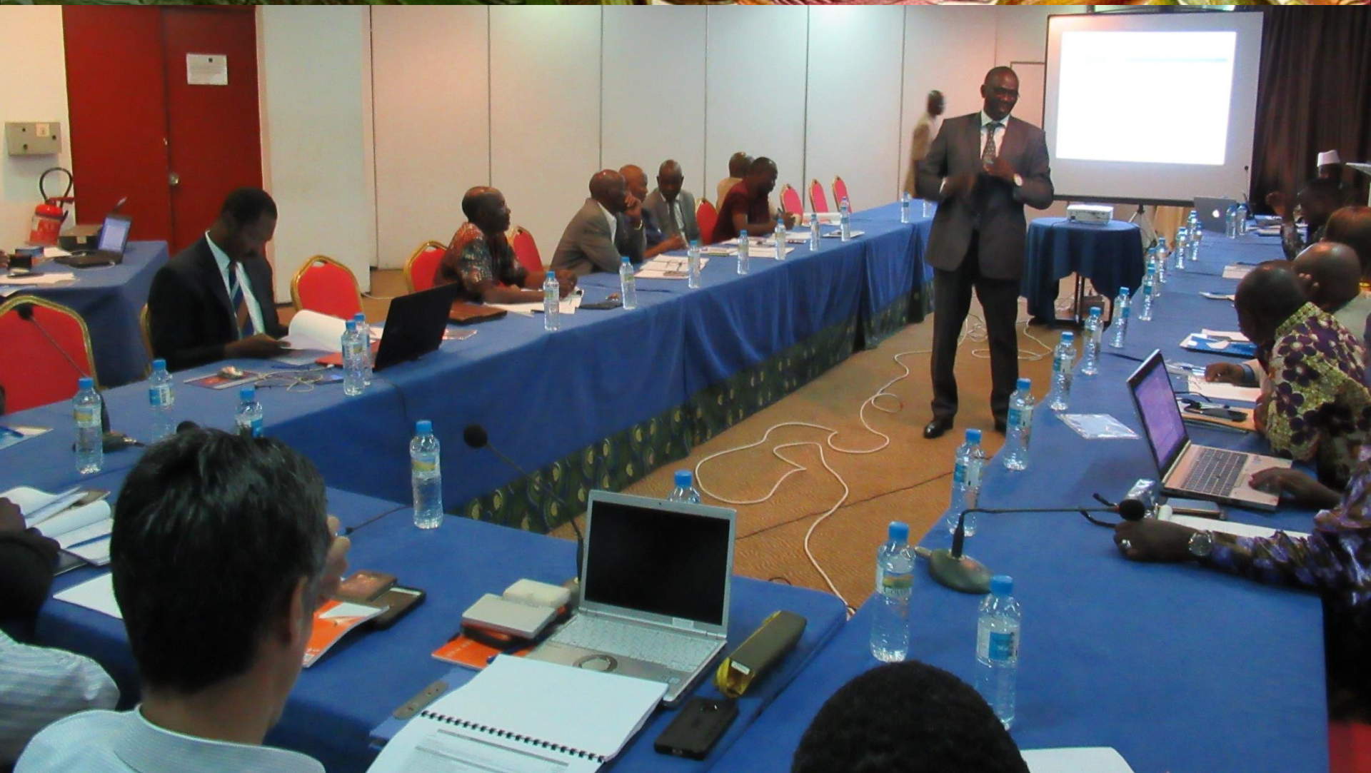
STDF project elaboration meeting in Guinea in September 2017

Protecting the world's plant resources from pests