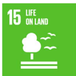
Goal 15. Protect, restore and promote sustainable use of terrestrial ecosystems, sustainably manage forests, combat desertification, and halt and reverse land degradation and halt biodiversity loss.