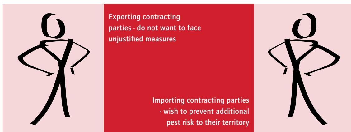
Figure 3.1. The two sides of concern arising from diversion from intended use.

One case discussed in the section 4 (Findings) shows that declaring emergency measures when diversion is suspected, in order to allow time for revision of the PRA related to existing phytosanitary import requirements, is politically charged and very demanding on the NPPO taking this step.